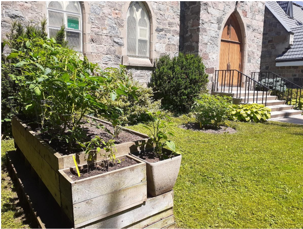
Figure ICC Community Garden, July 2024