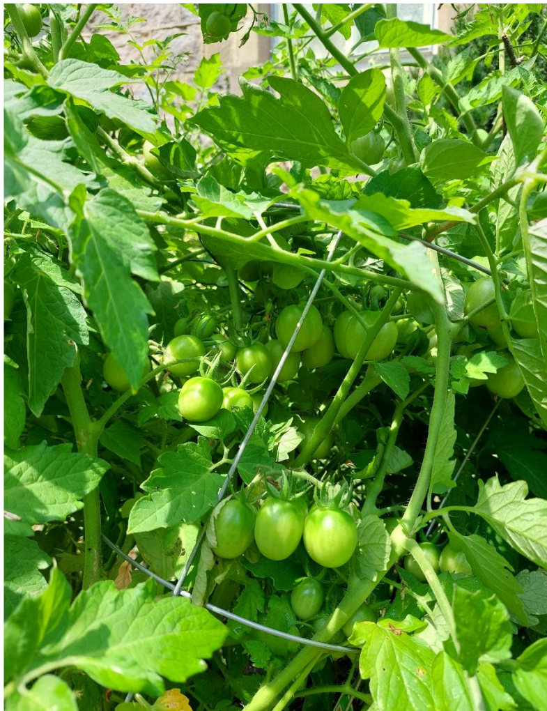
Figure 2CC Community Garden Aug 4, 2024