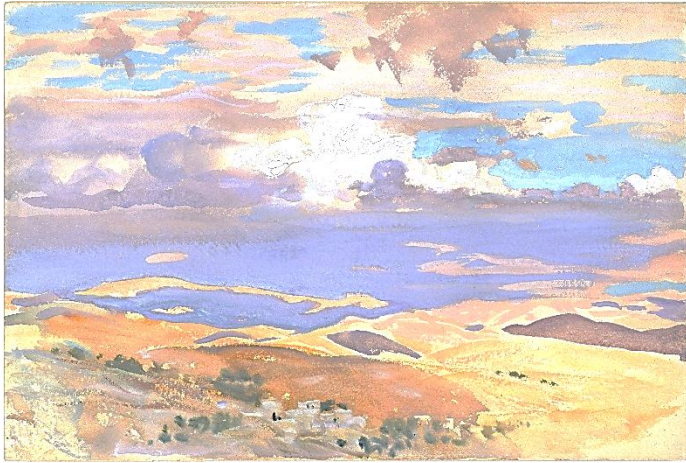
From Jerusalem, John Singer Sargent, 1905-6.

Please join us SUNDAY for In Person Worship